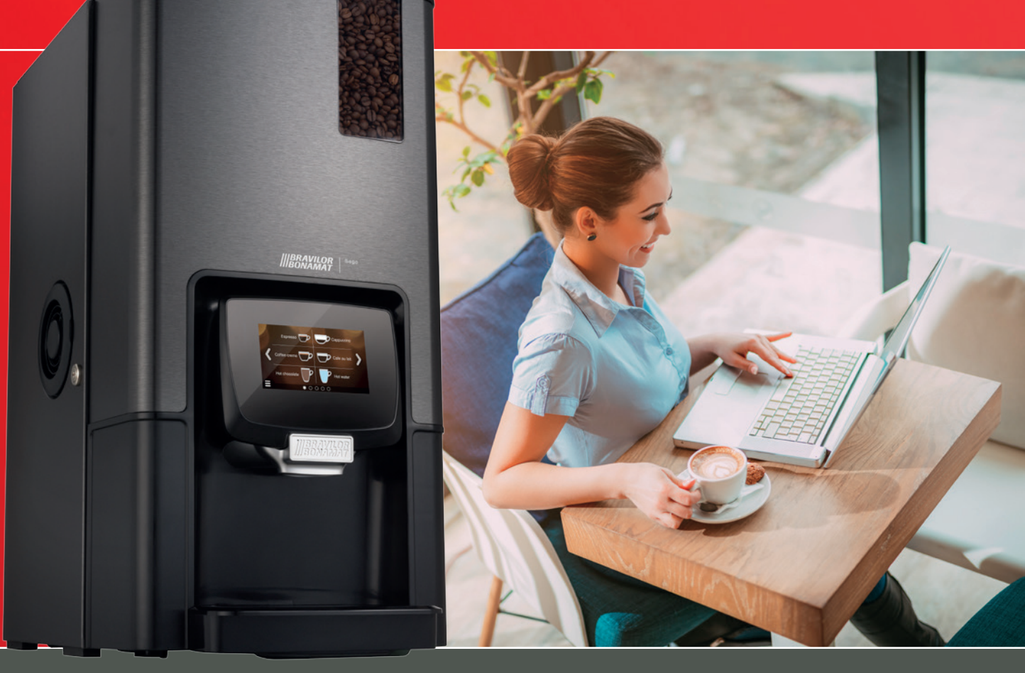
The taste of quality worldwide